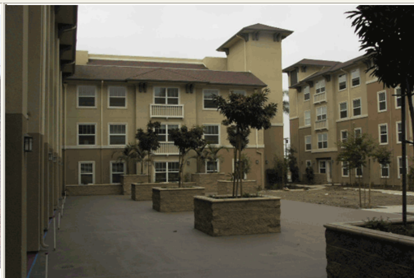
Las Brisas after redevelopment.